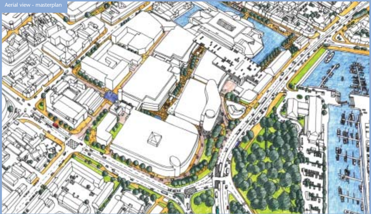
Aerial view - masterplan

For more information and to give us your feedback, please call our dedicated information line on 08456 121 109 . This information is also available in other formats and languages upon request.